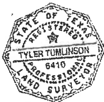
EXHIBIT A PAGE 1 OF 2